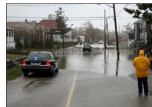
Emergency Personnel helping with an evacuation during the Patriot's Day Storm

How to information is available through MEMA's website ( mass.gov/mema ) under the "Hot Topics" section. It addresses many subject areas, including: