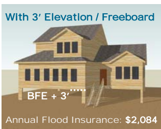
Example of an elevated home and the possible insurance savings

these steps can lower one's flood insurance premiums and result in long-term savings (see fact sheet 5 on the StormSmart Coasts webpage):